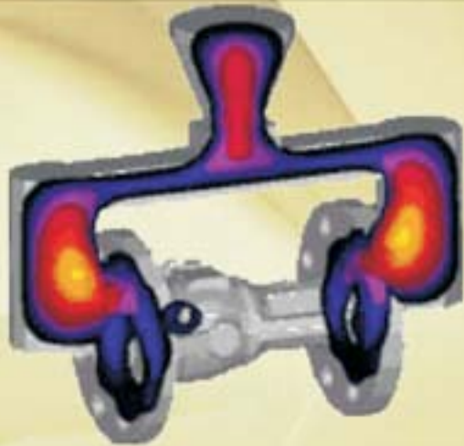
INVESTMENT CAST STEEL VALVE BODY

if YES then USE Casting Simulation from FSI To Improve Quality, Reduce Lead Time and Cut Cost