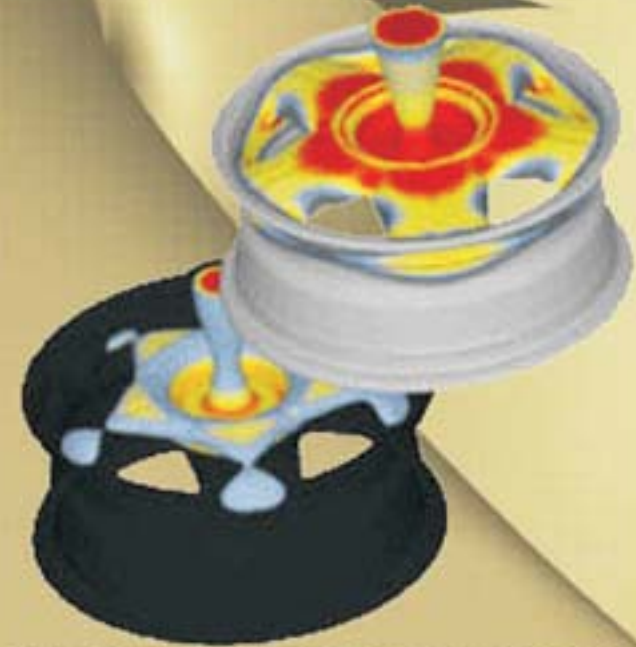
CAR RIM IN SOLIDIFICATION PROCESS

TEAM OF ENTHUSIASTIC PROFESSIONALS AT SIMCON TO SAVE YOUR PRECIOUS TIME AND COST IN CASTING